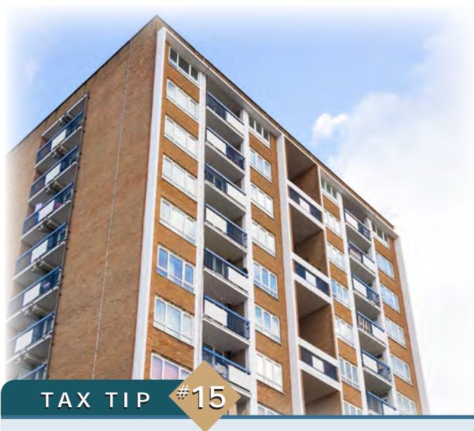
A 1031 Tax Deferred Real Estate Exchange postpones the payment of Federal Taxes until the property is actually sold.

If you are a real estate investor or builder, you can reduce your tax bill with the low-income housing tax credit. This annual credit applies to your qualified new low-income housing construction costs. The credit is granted for ten consecutive years. Some or all of it can be taken against tax on any type of income, and the unused credit can be carried forward or carried back. For Federally subsidized construction, and for existing housing acquisition, there is a similar credit. The Tax Cuts and Jobs Act lowered the corporate tax rate from 35 to 21 percent, which impacts pricing for the housing credit and affordable housing production, but did retain the credit.