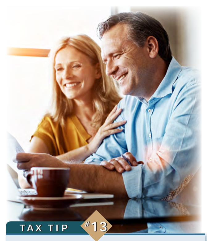
Try to hold on to stocks for at least a year if you have a gain. The short-term capital gains tax may have you paying more.

Always review gains and losses before the end of the year so you can offset gains and make sure you have paid enough in estimated taxes.