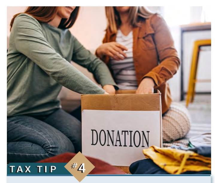
The Federal Tax Code encourages charitable contributions. After age 70 ½ you may make a direct transfer from your IRA of up to $100,000 (limited to 30% of AGI).

Student Loan Interest. Up to $2,500 of interest on student loans incurred during the year may be deducted. Since this is an "above-the-line" deduction, even non-itemizing taxpayers benefit. The loans must be used for qualified higher education expenses, such as tuition, fees, room, board, and books. If you are in a higher tax bracket, you may not be eligible for this deduction because of the phaseout rules. For more information, see the chart on page 11.