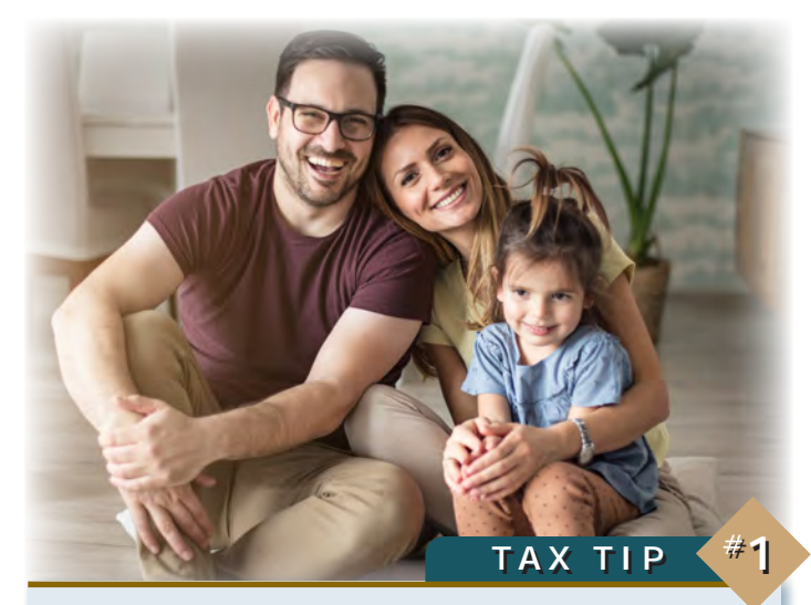
A good strategy for minimizing your AMT liability is to keep your adjusted gross income (AGI) as low as possible. We can help you do that.

Those who adopt a child can receive a tax credit of up to $14,440 for qualified adoption expenses in 2021, subject to income limitations (see page 11). Those adopting a child with special needs may claim a $14,440 tax credit in the year the adoption is completed, even if they do not have qualified adoption expenses.