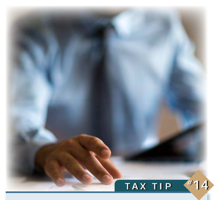
Delay late-year mutual fund investments until after the fund's dividend date.